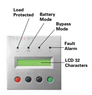
Front panel LCD control panel LCD, rotating (tower/rack format), multilingual, backlit