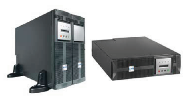
Versatile form factor

The Eaton® EX RT UPS is a UPS designed for sensitive high-density server environments and harsh industrial applications. Specifically engineered to meet demanding customer applications in IT systems, measuring instruments, PLCs and industrial PC markets, the EX RT is fully compatible with genset redundancy requirements in most instances. The manual bypass, hot-swap I/O box and intuitive LCD control panel are just a few of the many differentiating features that make the EX RT the ideal product for the 5–11 kVA power range.